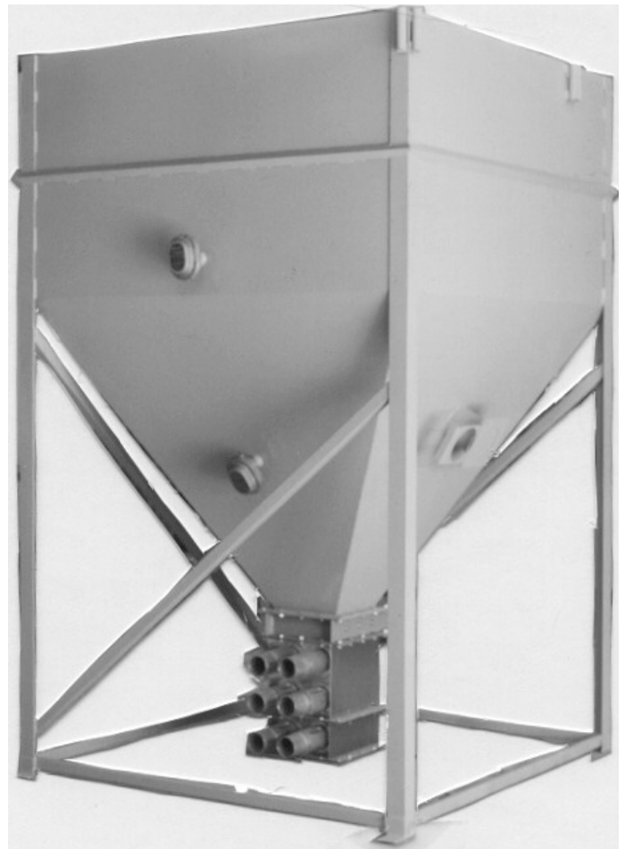
Eagle Surge Bin with Drain Stub, Slide Gate, Vacuum Distribution Box, Material Level Indicators, Roof Vent, and Roof Access Door

Sight windows or material level controls are used for inventory purposes.